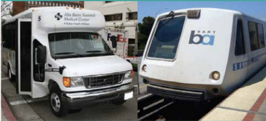
Alta Bates Summit Medical Center Parking and Transportation Department