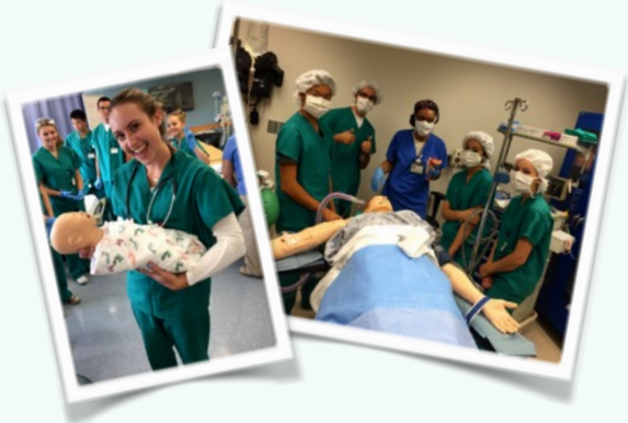
FACES Scholars engage in clinical skills practice.

Our FACES Summer Medical Academy has been offered since 2005.