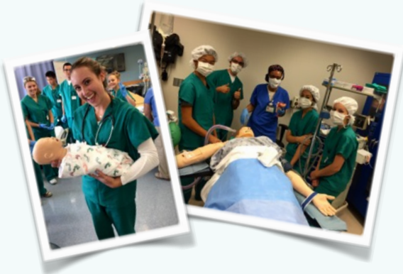
FACES Scholars engage in clinical skills practice.

FACES for the Future started in 2000 at Children's Hospital, Oakland. Since that time, we've created new programs in San Diego, Imperial Valley, Hayward, Oakland and San Francisco. Our FACES Summer Medical Academy has been offered since 2005.